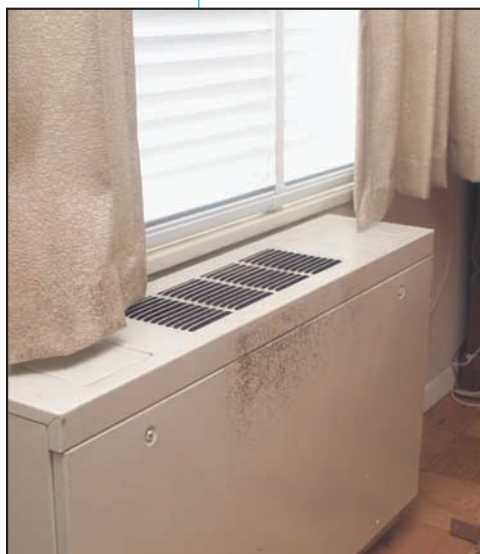
Mold growing on the surface of a unit ventilator.