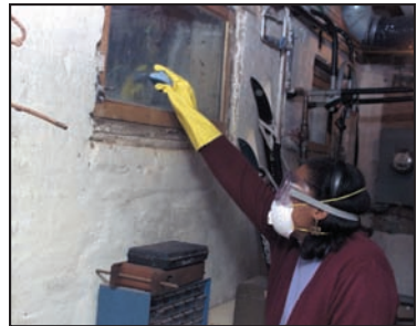
Cleaning while wearing N-95 respirator, gloves, and goggles.

■ Wear goggles. Goggles that do not have ventilation holes are recommended. Avoid getting mold or mold spores in your eyes.