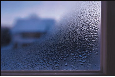
Condensation on the inside of a windowpane.