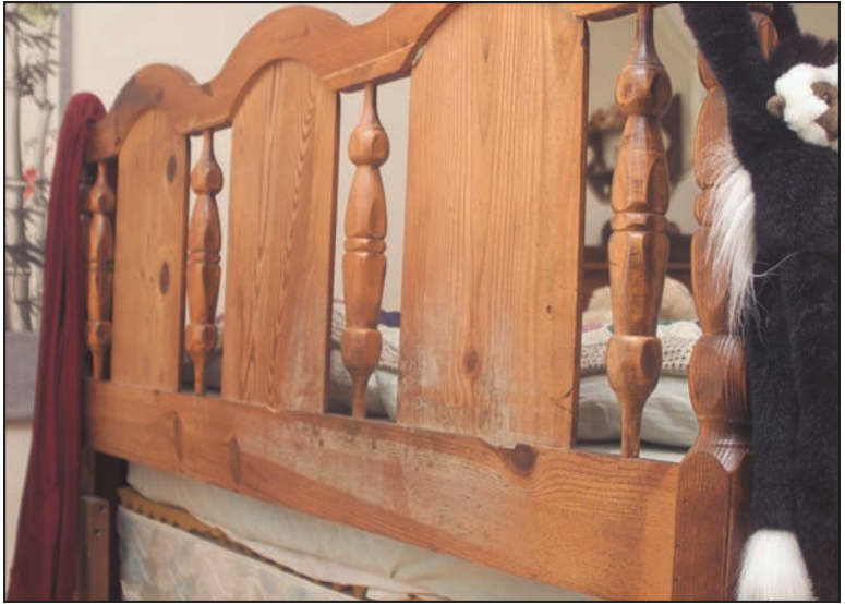
Mold growing on a wooden headboard in a room with high humidity.