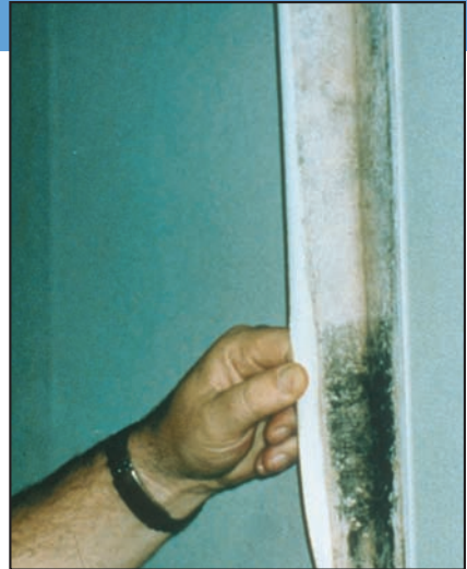
Mold growing on the back side of wallpaper.

Suspicion of hidden mold You may suspect hidden mold if a building smells moldy, but you cannot see the source, or if you know there has been water damage and residents are reporting health problems. Mold may be hidden in places such as the back side of dry wall, wallpaper, or paneling, the top side of ceiling tiles, the underside of carpets and pads, etc. Other possible locations of hidden mold include areas inside walls around pipes (with leaking or condensing pipes), the surface of walls behind furniture (where condensation forms), inside ductwork, and in roof materials above ceiling tiles (due to roof leaks or insufficient insulation).