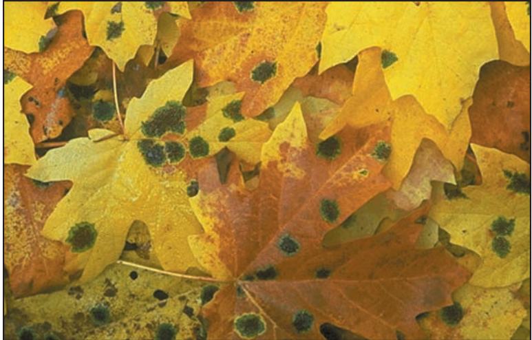
Mold growing on fallen leaves.

This document is available on the Environmental Protection Agency, Indoor Environments Division website at: www.epa.gov/mold