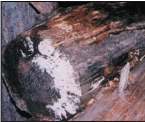
Mold growing outdoors on firewood. Molds come in many colors; both white and black molds are shown here.

Molds are part of the natural environment. Outdoors, molds play a part in nature by breaking down dead organic matter such as fallen leaves and dead trees, but indoors, mold growth should be avoided. Molds reproduce by means of tiny spores; the spores are invisible to the naked eye and float through outdoor and indoor air. Mold may begin growing indoors when mold spores land on surfaces that are wet. There are many types of mold, and none of them will grow without water or moisture.