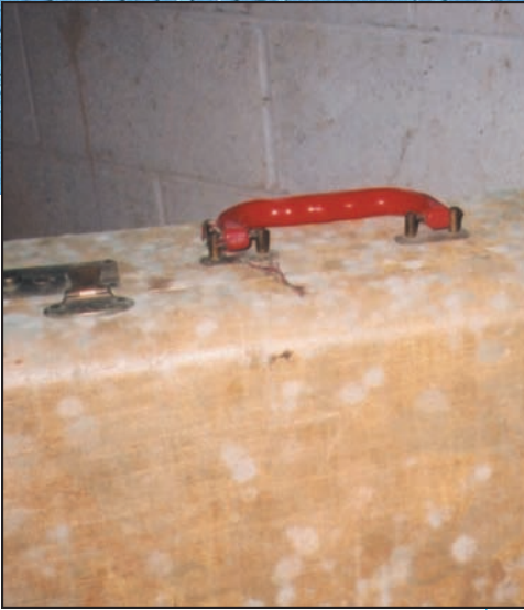
Mold growing on a suitcase stored in a humid basement.

It is important to take precautions to LIMIT YOUR EXPOSURE to mold and mold spores.