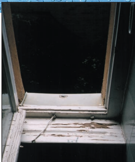
Leaky window – mold is beginning to rot the wooden frame and windowsill.

If you already have a mold problem – ACT QUICKLY. Mold damages what it grows on. The longer it grows, the more damage it can cause.