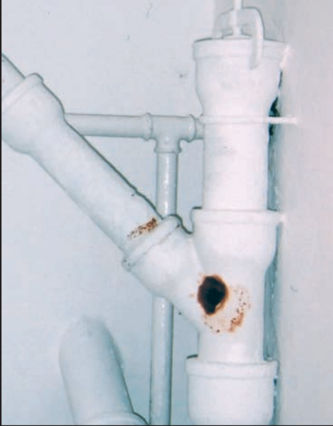
Rust is an indicator that condensation occurs on this drainpipe. The pipe should be insulated to prevent condensation.

Renters: Report all plumbing leaks and moisture problems immediately to your building owner, manager, or superintendent. In cases where persistent water problems are not addressed, you may want to contact local, state, or federal health or housing authorities.